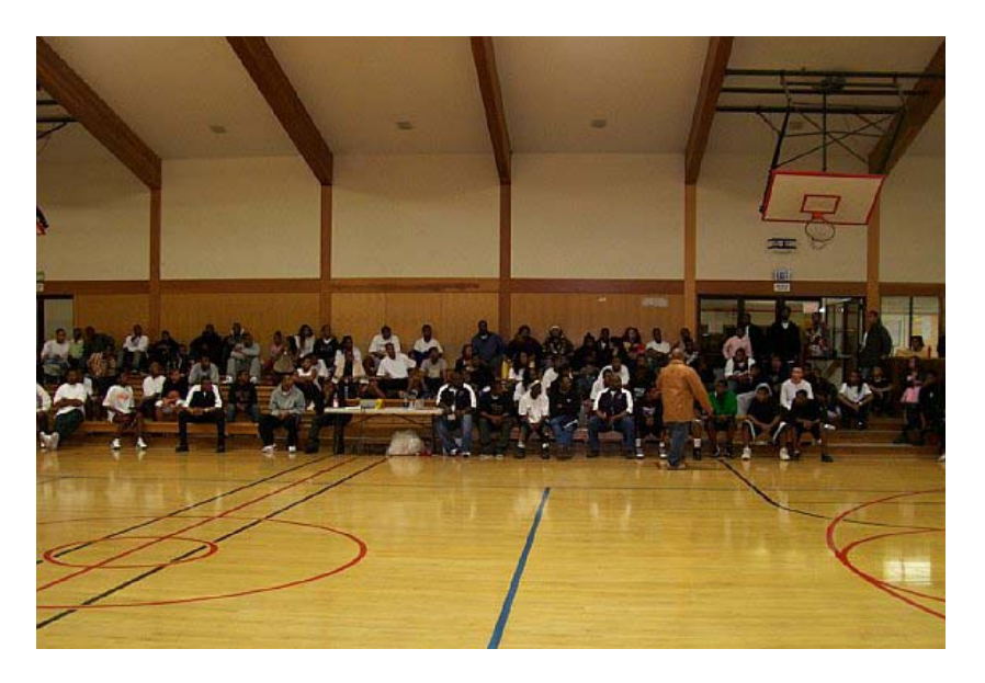
Oakland Midnight Basketball 2008. 12 teams of 12 players.