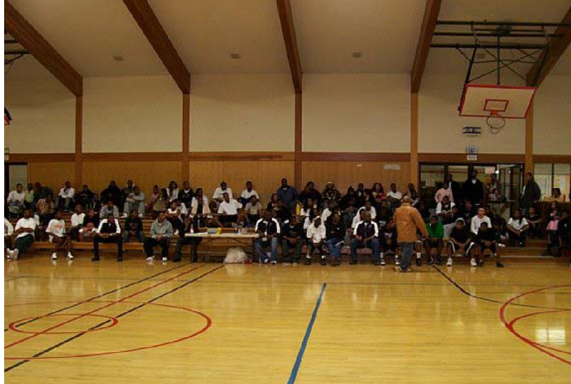
Oakland Midnight Basketball 2008. 12 teams of 12 players.