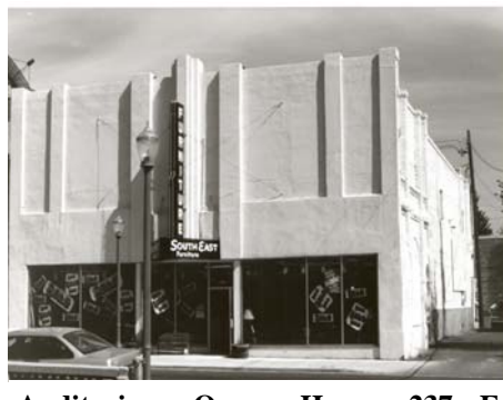
Auditorium Opera House—237 E. Center—1900/1939

even though the parapet reads 1913. The store front has been radically remodeled with a modern awning, wood siding and small single-pane windows. The building has been occupied by a variety of office and commercial tenants.