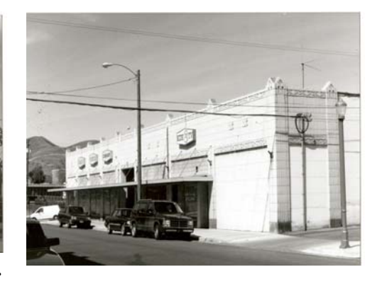
City Building, 210 E. Center—1915-21/1938

a one-story brick building, but by 1921 two stories had been added and the building housed a hotel. This building is also associated with Greek, Japanese and Jewish businesses in early Pocatello history.